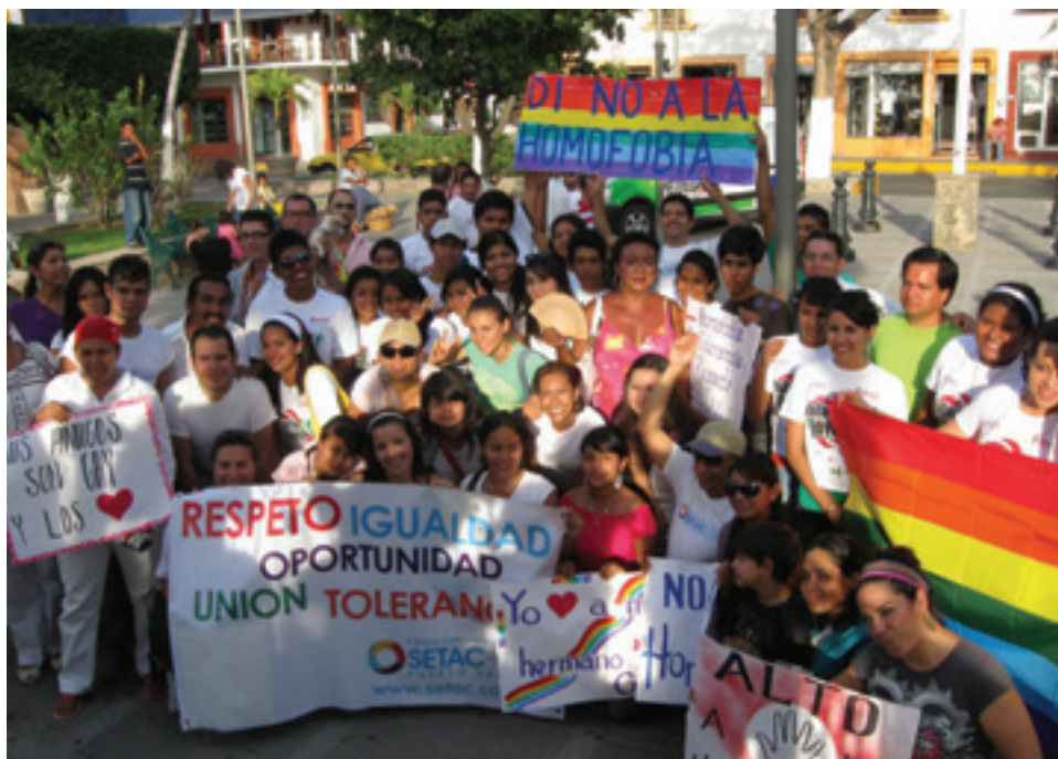
VES (Puerto Vallarta, Mexico)

Example of a Recent Project: An LGBT organization (anonymity was requested) in Rwanda received a UAF grant of $3,500 for the protection, health and communication abilities of its members over three months due to recent threats the organization received as a result of their human rights work.