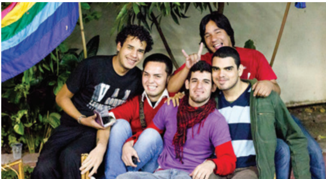
SOMOSGAY (Asuncion, Paraguay)

population, vulnerable groups, health services, education, research, advocacy and consulting through quality management.”