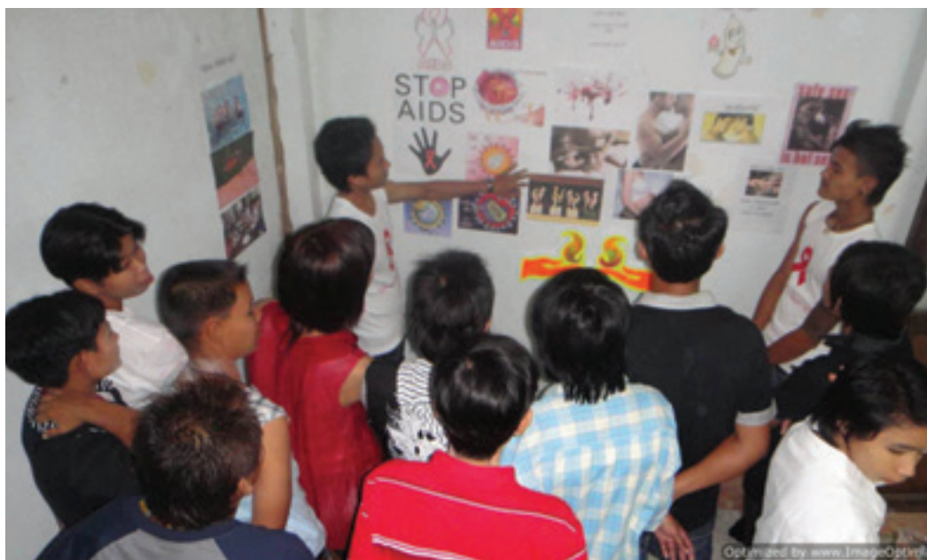
The Human Rights Education Institute of Burma (Chiang Mai, Thailand)

Mission: “The Collaborative Fund for HIV Treatment Preparedness is a nonprofit, community-driven funding mechanism to support HIV treatment advocacy and education efforts in Africa, Asia, the Caribbean and Latin America, and NIS/CIS/Baltics. In each funding region, the Collaborative Fund provides grants for community-based organizations for HIV treatment advocacy and education projects; and support for regional networks to share information, implement collaborative strategies, and provide technical assistance to grantees.”