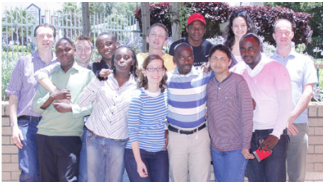
Community peer reviewers from an Africa review meeting (Johannesburg, South Africa)

Example of a Recent Project: “Beijing Dongzhen-Nalan Cultural Communication Co. Limited (BDNCCC), received $36,500 to strengthen civil society and advance respect for human rights. BDNCCC will facilitate several trainings for civic groups to introduce to participants basic concepts of human rights and organizational development skills, such as management systems, leadership, and team building.” This organization works directly with MSM groups; its focus is on sexual minorities and vulnerable groups.