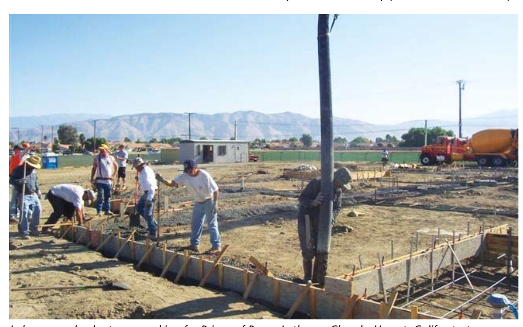
Laborers and volunteers, working for Prince of Peace Lutheran Church, Hemet, Calif., start construction on the 11,400-square-foot family life center that will give the growing congregation more space for ministry and community outreach activities. The building is expected to be complete this

The dedication celebration was Nov. 2, 2008.