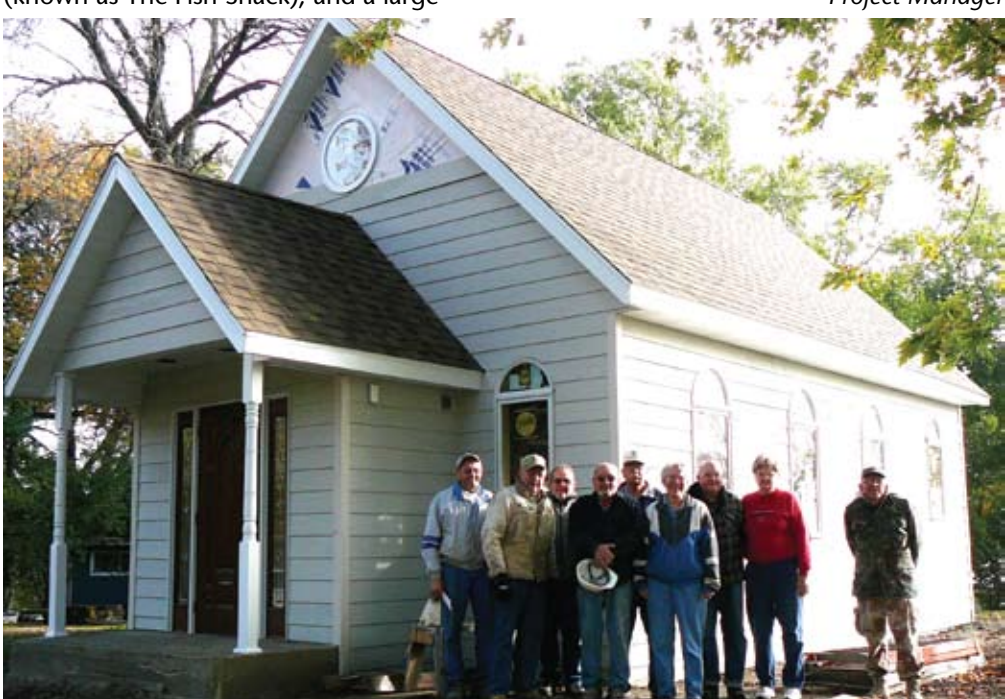
A Laborers For Christ team and other volunteers worked this fall to help clean up and make repairs at Camp Okoboji, an LCMS camp located on a wooded peninsula on West Lake Okoboji in Milford, Iowa. Here they are in front of "The Refuge," a small prayer chapel that seats 30 to 40 people.