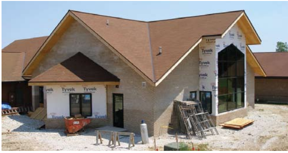
The Risen Savior, Franklin, Wis., congregation is one of many LCMS organizations that has partnered with LCEF. To read more about Risen Savior, see page 3.

person, your investment in Lutheran Church Extension Fund is working in each of these locations, in addition to many others around the country and world. Your dollars are building and expanding churches, schools and preschools, and supporting your brothers and sisters in Christ.