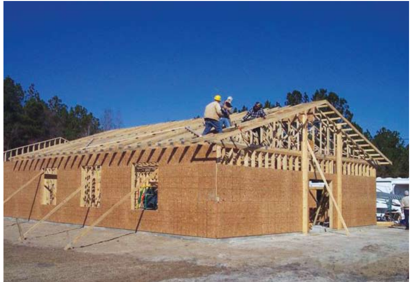
Laborers For Christ, working for Holy Trinity Lutheran Church, Kingsland, Ga., helped expand the church with a 6,290-sq.-ft. addition.

gation also plans to start a preschool in the not-too-distant future.