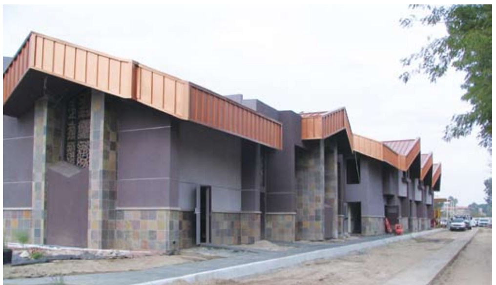
Returning to Our Savior's Community Lutheran for a second project, Laborers For Christ built a new two-story ministry center, which added much-needed worship space, offices, and a choir room.