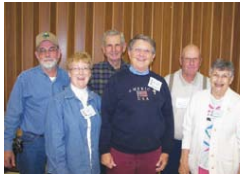
Volunteers come from all over the country for the Rendezvous, but Effingham, Ill., was well represented this year!