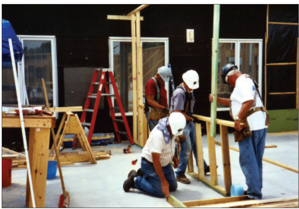
Laborers, working for Peace Lutheran Church, Andover, Kan., erect walls for the 8,200-sq. ft. hall that will replace the double-wide trailer the congregation now uses for fellowship activities.