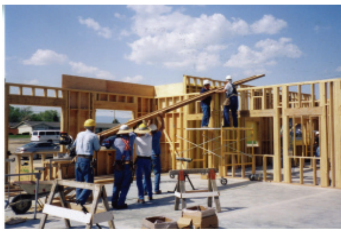
Laborers and volunteers from Immanuel Lutheran Church, Sheridan, Wyo., erect walls on the 5,200 sq. ft. fellowship hall, the first for the 104-year-old congregation.