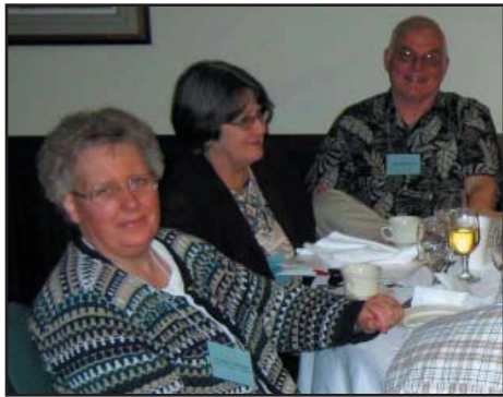
Participants at the 2008 NWI LCEF spring training sessions (all photos this page.)