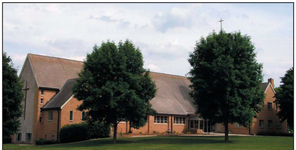
Peace Lutheran Church in Wall Lake, Iowa had a very positive response to LCEF’s Consecrated Stewards process.

Are you interested in Consecrated Stewards for your members? If so, contact your district LCEF vice president or the national office ( see page two .) %