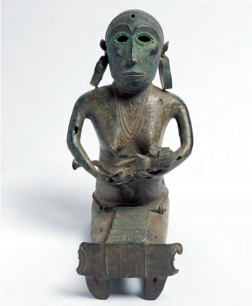
Indonesia The bronze weaver 6th century bronze National Gallery of Australia, Canberra Purchased 2006