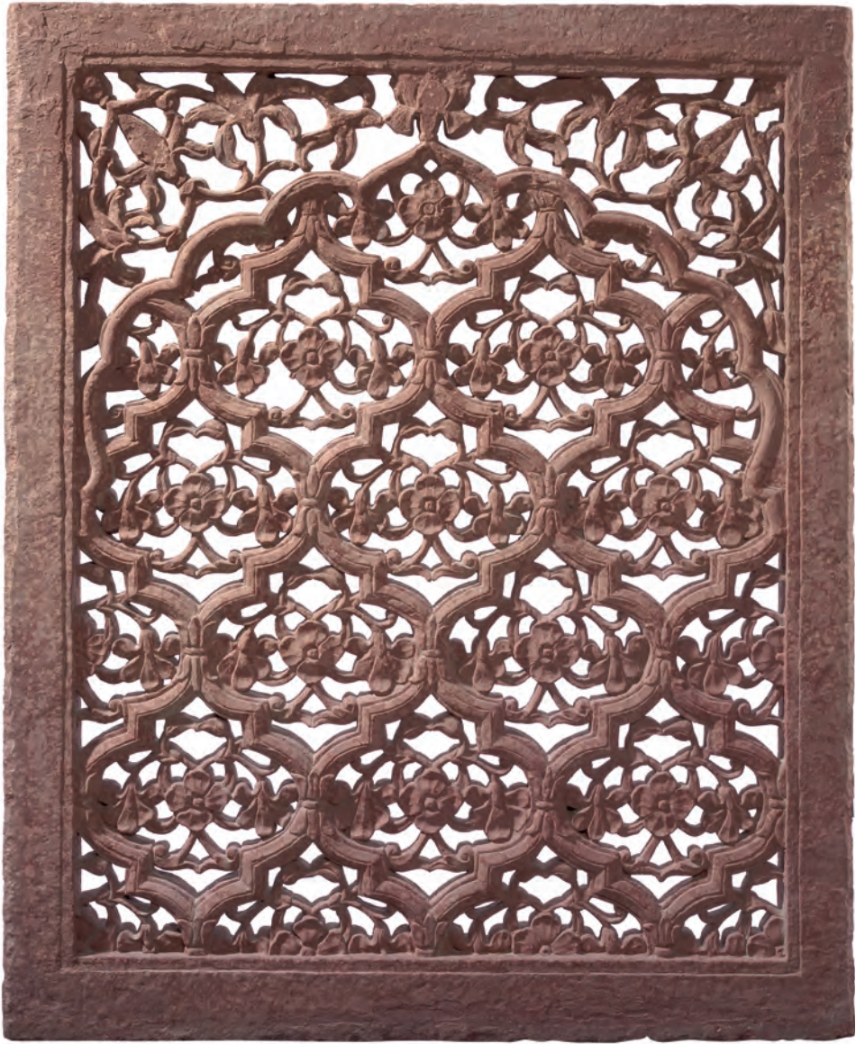
India Open-worked pierced screen [jali] c. 1630–1650 red sandstone National Gallery of Australia, Canberra Purchased 2005