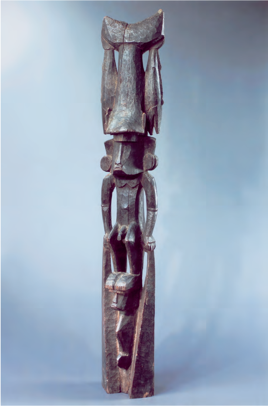
Solomon Islands, Owa-Raha (Santa Ana) Post from ceremonial house c. 1900 wood National Gallery of Australia, Canberra Purchased 2006