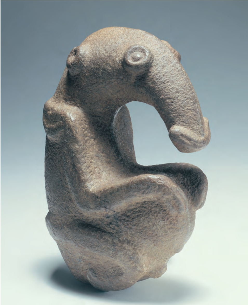
Papua New Guinea The Ambum stone c. 1500 BCE greywacke stone National Gallery of Australia, Canberra Purchased 1977