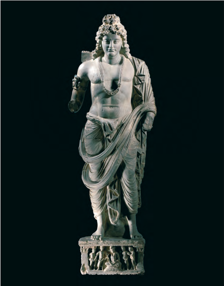
Gandharan region, Afghanistan or Pakistan Standing bodhisattva Kushan period 3rd–4th century schist stone National Gallery of Australia, Canberra Purchased 2006