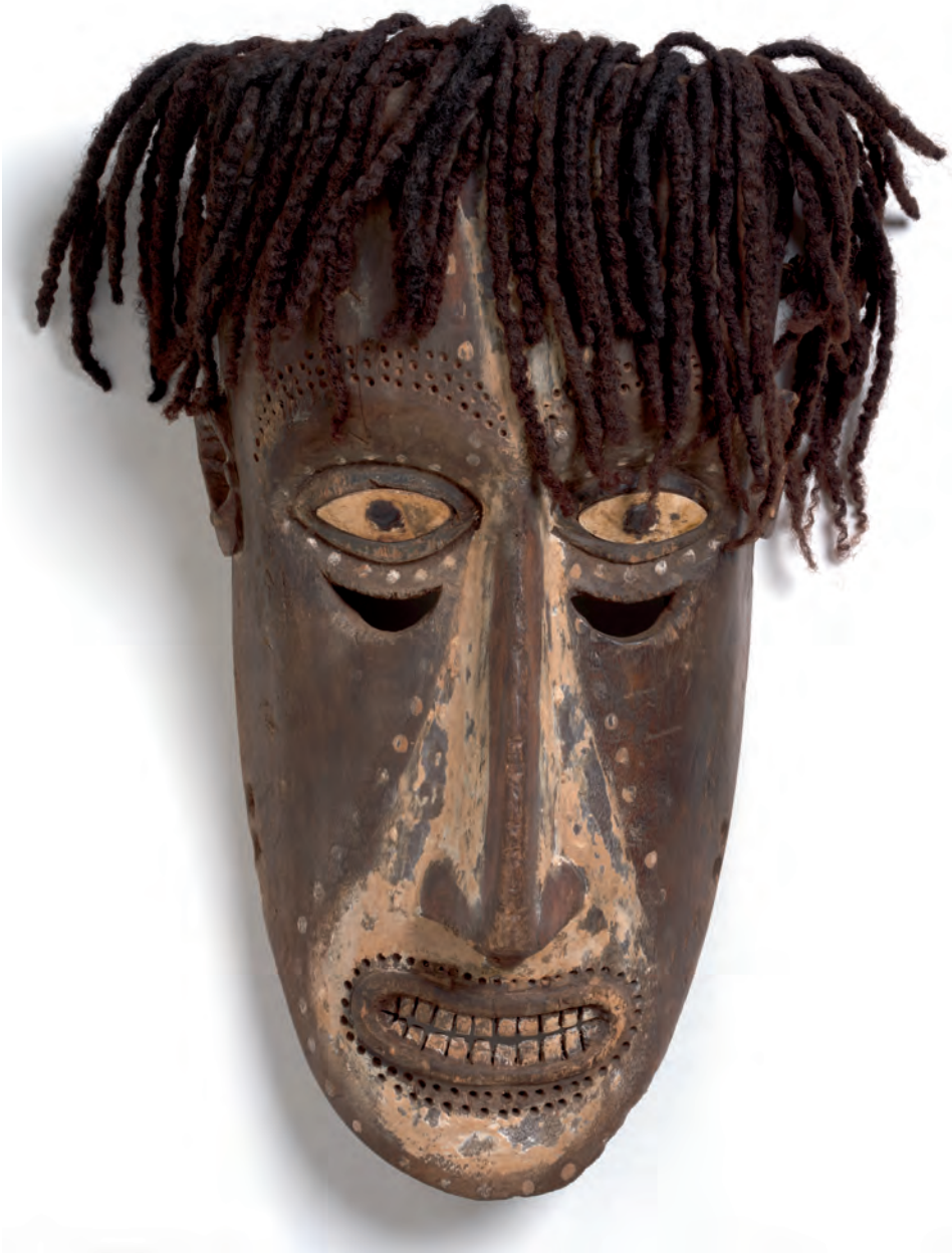
Torres Strait Islander people Unknown maker Mask 19th century wood, shell, resin, human hair, fibre string, white pigment National Gallery of Australia, Canberra Purchased 2006