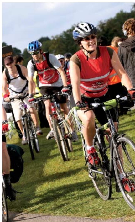
Cycling to London from Clapham.

"Although we were encouraged to cycle from Bromley, as first timers we thought this would be too far so we took the train to London Bridge. It was a great day