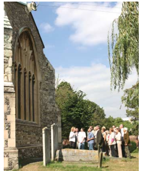
The Havering group discovers the history of the surroundings.