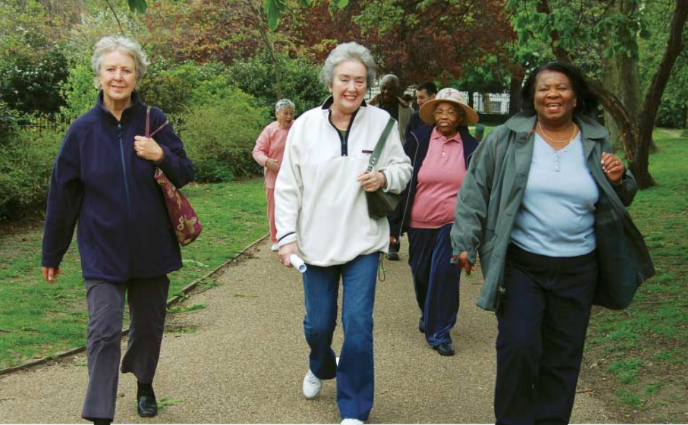
Ladies from Southwark Adult Education Group enjoy a walk in the park.