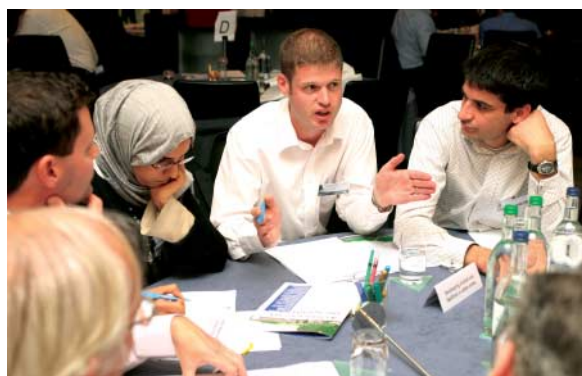
Delegates were quick to share their ideas during the discussion session at the 2007 conference.