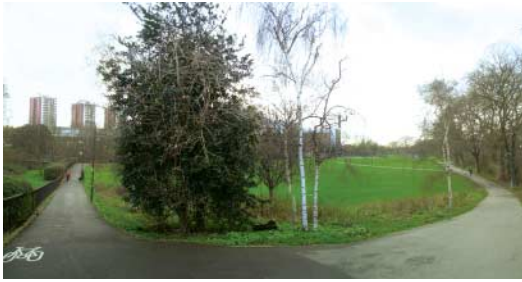
Ladywell Fields before the scheme . . .

. . . and after the improvements were completed.