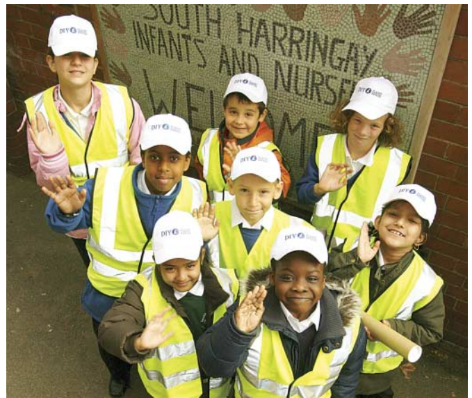
Pupils from South Harringay Infants School get involved with the big WoW.

Thanks to TfL funding and partnership working