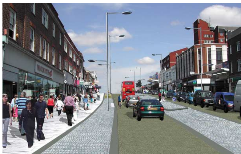
Full potential: Dagenham Heathway will be radically improved for pedestrians.

Living Streets has been involved in the project, providing a link between the community and Barking and Dagenham Council. The organisation