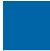
PMS 301C C100 M68 Y21 K5