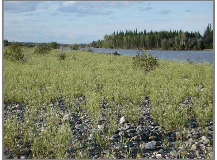
White sweetclover on Nenana River bar