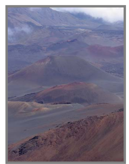
Haleakala NP, Maui