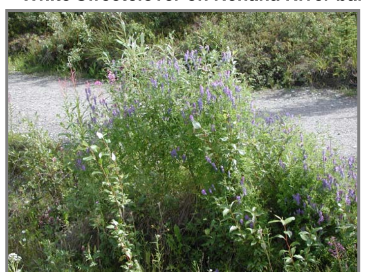
Bird vetch in Denali National Park (purple flowers)