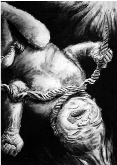
Cord Trauma by Marmot Snetsinger