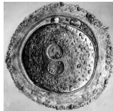
Zygote by Marmot Snetsinger

Tuition: $1430 (includes meals & lodging) (12 minimum participants/21 max)