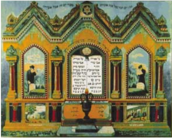
Left Yahrzeit Plaque (memorial plaque), Germany, c. 1910