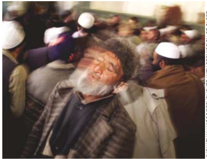
Sufi Muslim in a religious ceremony called Zikar. Kabul, Afghanistan, 2002