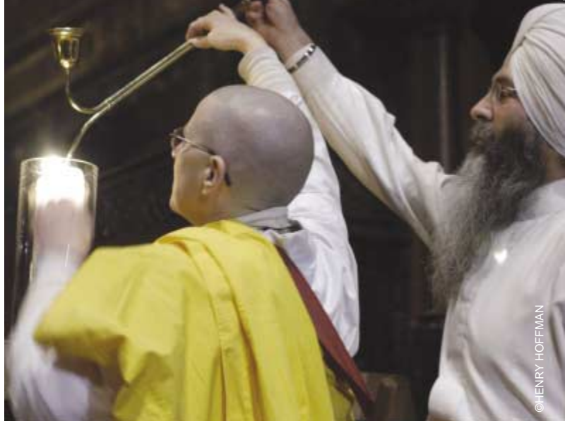
Interfaith peace service at Trinity Church in Boston, 2003

In his opening speech, Vivekananda offered a vision that continues to inspire some in the interfaith movement in its hope that believers across religious lines may make a positive difference in the world’s condition. Referring to the