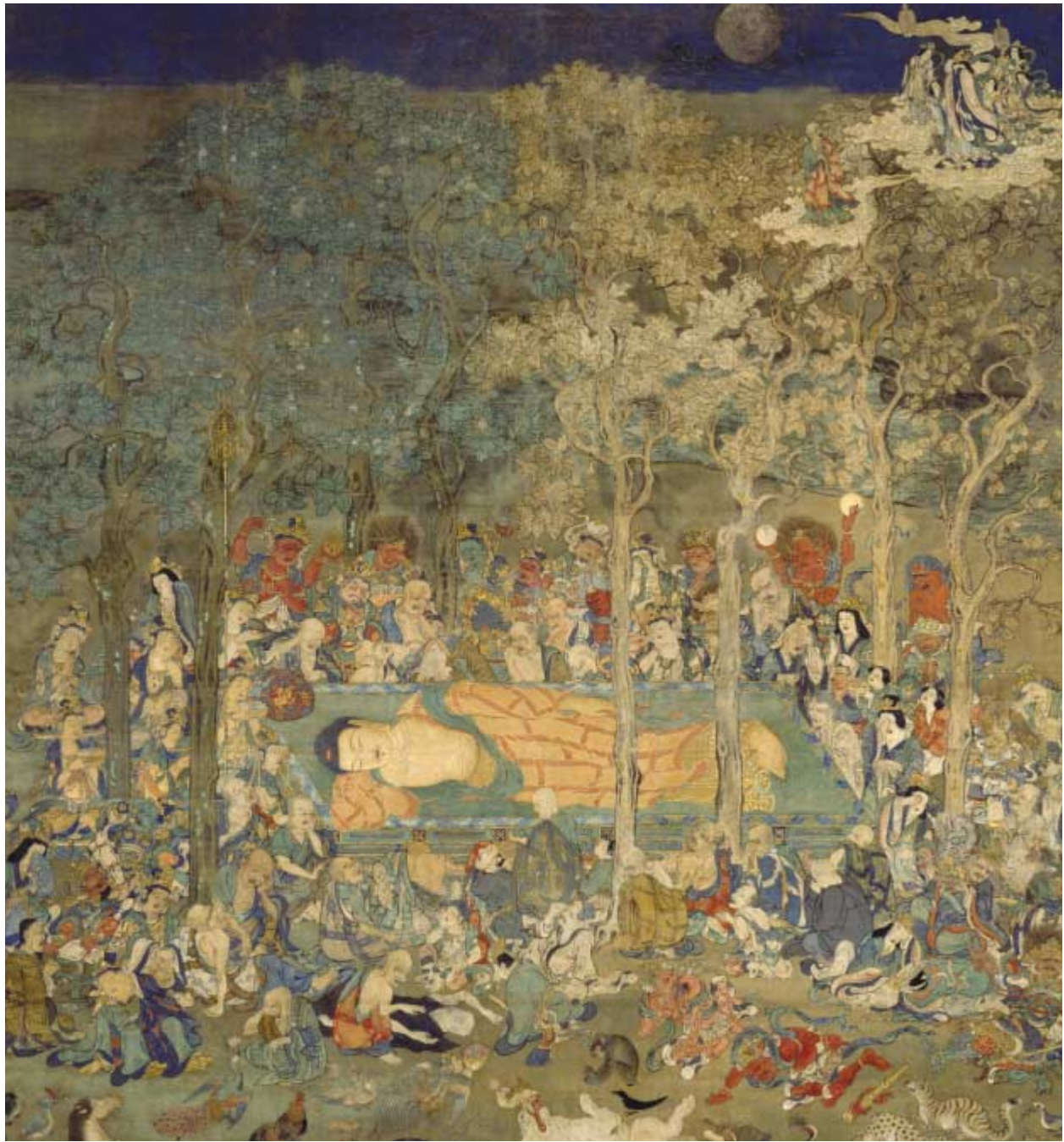
Death of the Historical Buddha , Unidentified Artist, c. 1185–1333, Kyoto, Japan

Christian teaching on the resurrection and the sacredness of the human body.”