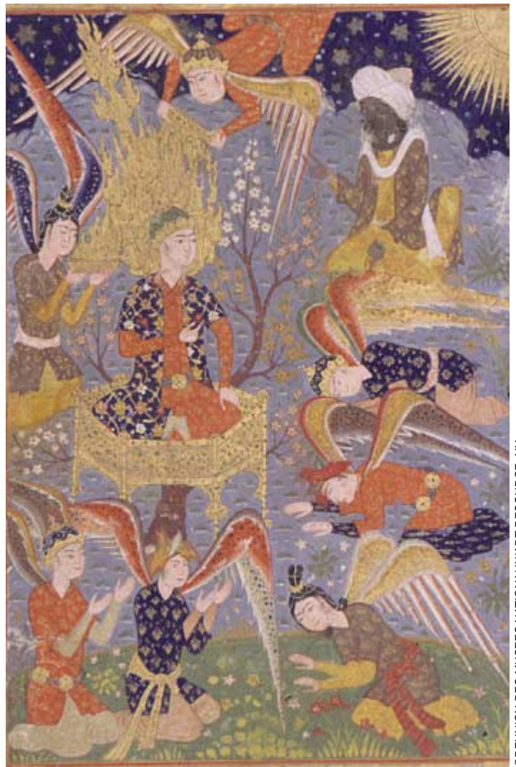
Adam Among the Angels , Louvre, Paris, France

Hindus, too, ceremonially wash the dead in a purifying ritual, but do so to prepare the body for cremation rather than burial. Death is not final in Hinduism; it is one state in an endless cycle of birth, life, death, and rebirth ( samsara ). The process by which an individual soul can be