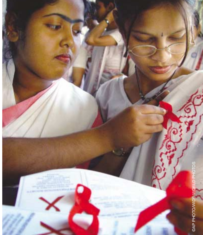
World AIDS Day, India, 2002