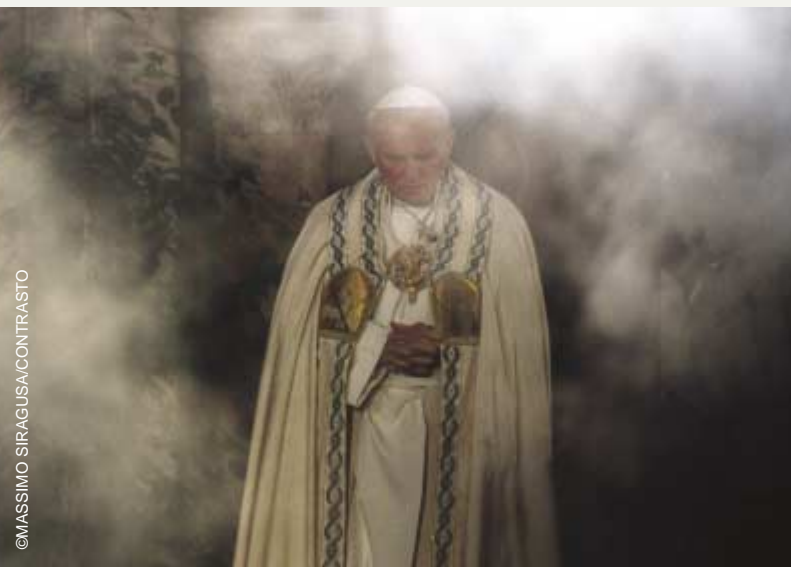
Pope John Paul II at interreligious assembly in Assisi, 1994

But being cooperative does not mean trying somehow to create a new religious faith. Indeed, many who have participated in interfaith dialogue report that by talking with people of other faiths, they gain a greater knowledge of and