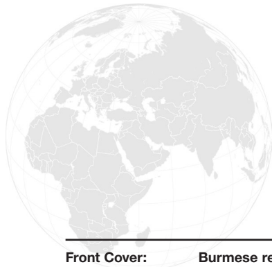
Front Cover: Burmese refugee children along the border of Thailand and Burma. Photo courtesy of Florentina Chiu/LIRS, May 2004.

Center for Victims of Torture Church World Service/Immigration & Refugee Program Episcopal Migration Ministries Hebrew Immigrant Aid Society Hmong National Development Immigration & Refugee Services of America/U.S. Committee for Refugees International Catholic Migration Commission International Refugee Research Institute International Rescue Committee Jesuit Refugee Service/USA Kurdish Human Rights Watch Lutheran Immigration & Refugee Service Migration & Refugee Services/United States Conference of Catholic Bishops National Alliance of Vietnamese American Service Agencies Southeast Asia Resource Action Center Women's Commission for Refugee Women & Children World Relief