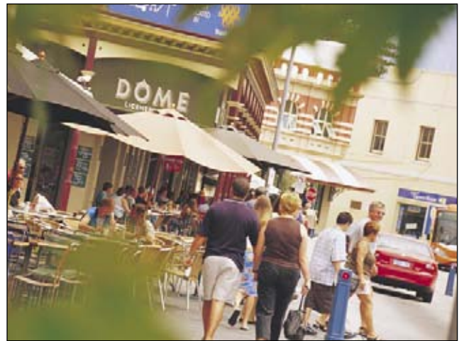
Market Street in Fremantle.

There's a character pub on every corner, and the streets are filled with interesting bookstores, galleries, boutiques and delicatessens brimful of local produce. This is the place to pick up a strand of Broome pearls, some colourful Majolica pottery, or some of the freshest produce available.